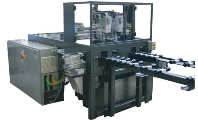
Complete Turn key Solutions

Send us your application: info@motionfab.com -manufacturing process to be automated -conceptual idea to be developed to market -product enhancements or retrofits -fabrication & precision machining parts/assemblies -or general inquires